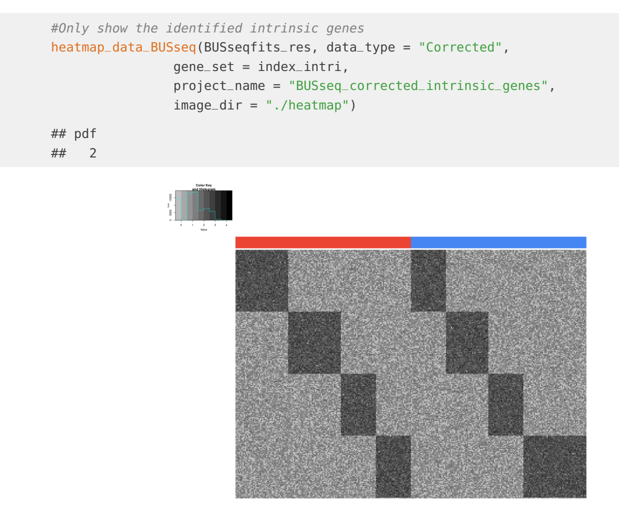
Figure 4: The heatmap for the corrected count data of the identified intrinsic genes.