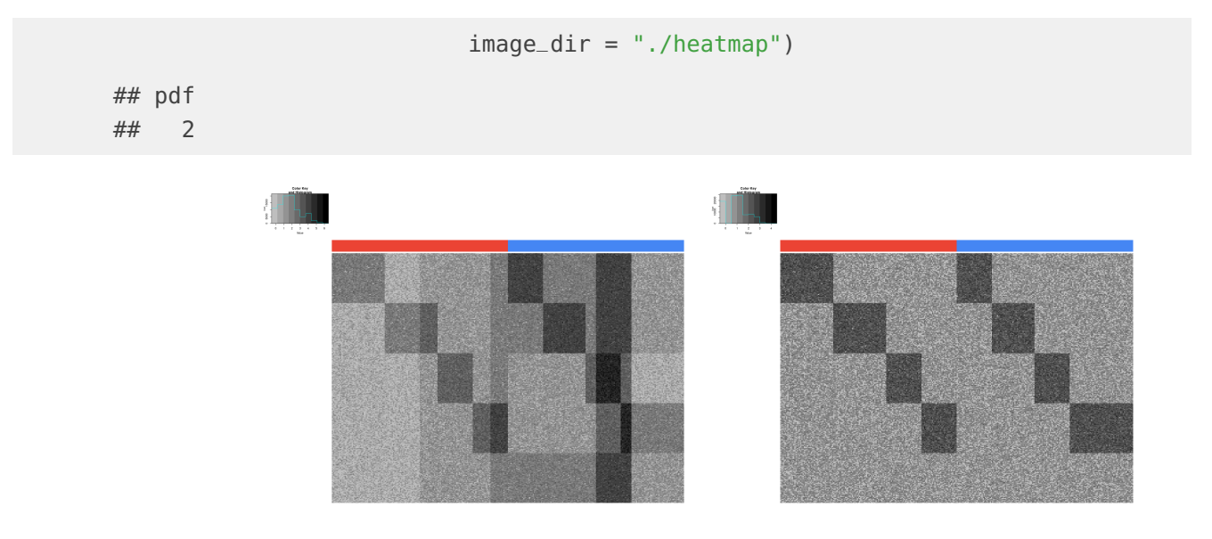
Figure 3: The heatmap for the imputed (left) and corrected (right) count data of all genes.

In all these heatmaps, the top bar indicates the corresponding batch of each cell. That's to say, cells under the same color are from the same batch. The batch effects present in the raw data are correctly removed in the corrected count data, and only the biological variabilities are kept. We can also only display the identified intrinsic genes in the corrected count data by setting the argument gene_set as the indices of the identified intrinsic genes index_intri in the last section.