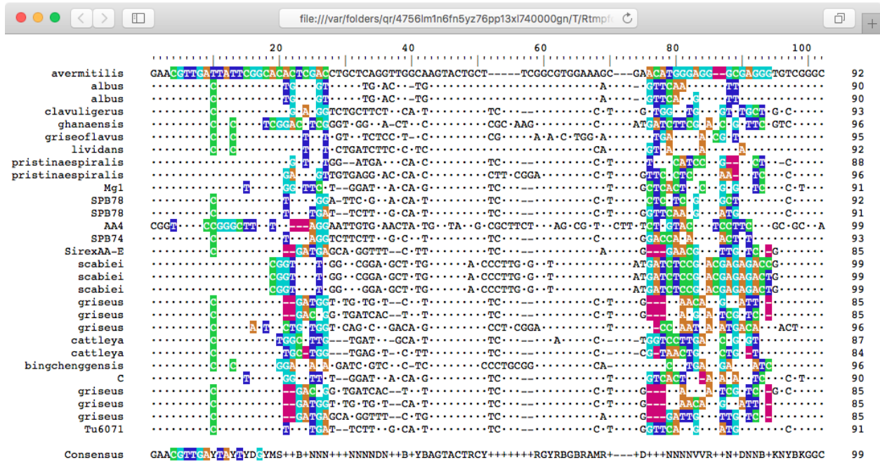
Figure 2: Amplicon with the target site for each primer colored

> # move the target group to the top > w <- which(names(amplicon)=="avermitilis") > amplicon <- c(amplicon[w], amplicon[-w])