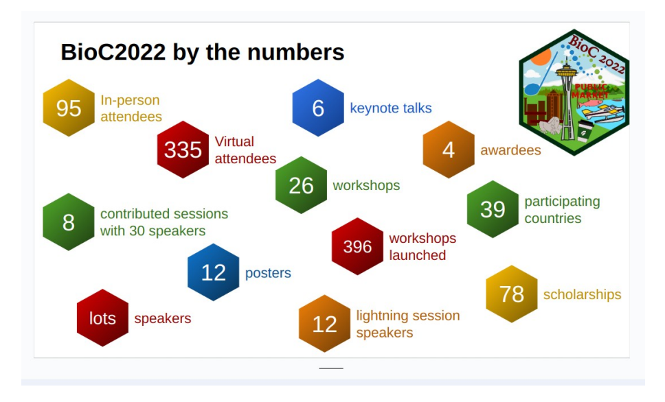
Figure 3: Review of events and participation in Bioc2022