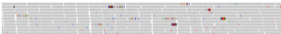
Figure 3: Simulated reads mapped in proper pair. Mismatches and soft-clips are shown as colored vertical lines in reads.